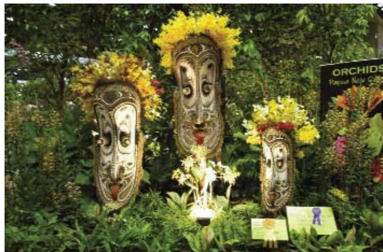
Best Landscape Group, Papua New Guinea (Singapore Orchid Show at the Singapore Garden Festival 2008)

This very important event in the world orchid calendar promises not to disappoint. Coupled with the fact that Singapore is also known for a wide array of good food, fantastic shopping and fascinating tourist attractions, the 20th WOC in Singapore will be an occasion not to be missed. See you in Singapore in 2011!