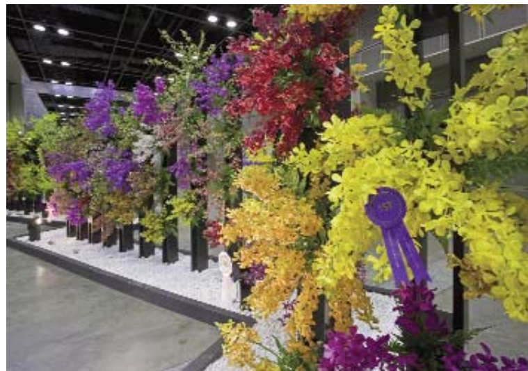
First prize in Mokara for the Commercial Cut Flower category (Singapore Orchid Show at the Singapore Garden Festival 2008)