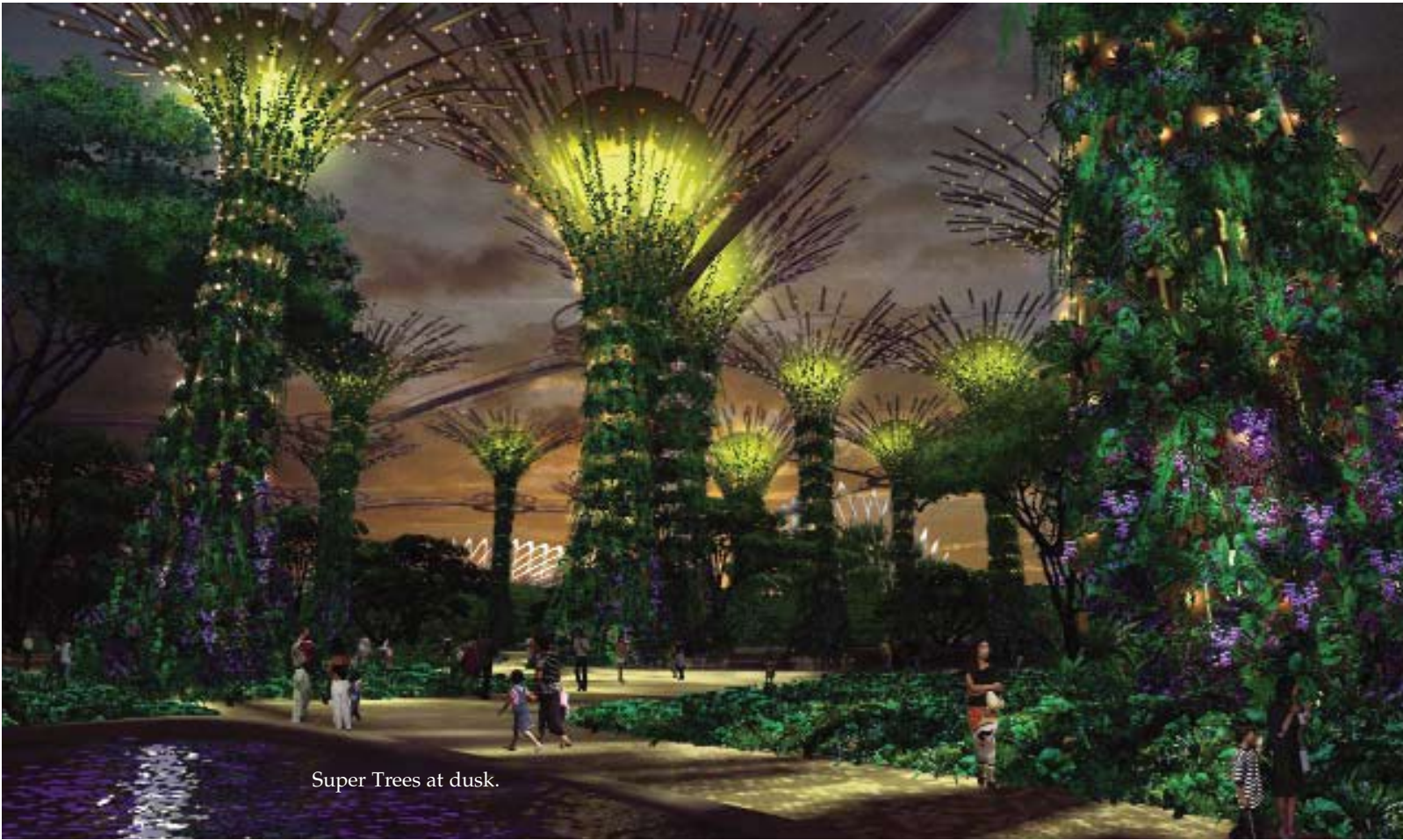
Super Trees at dusk.

the Bay will be featured prominently in the programming for the 20th WOC.