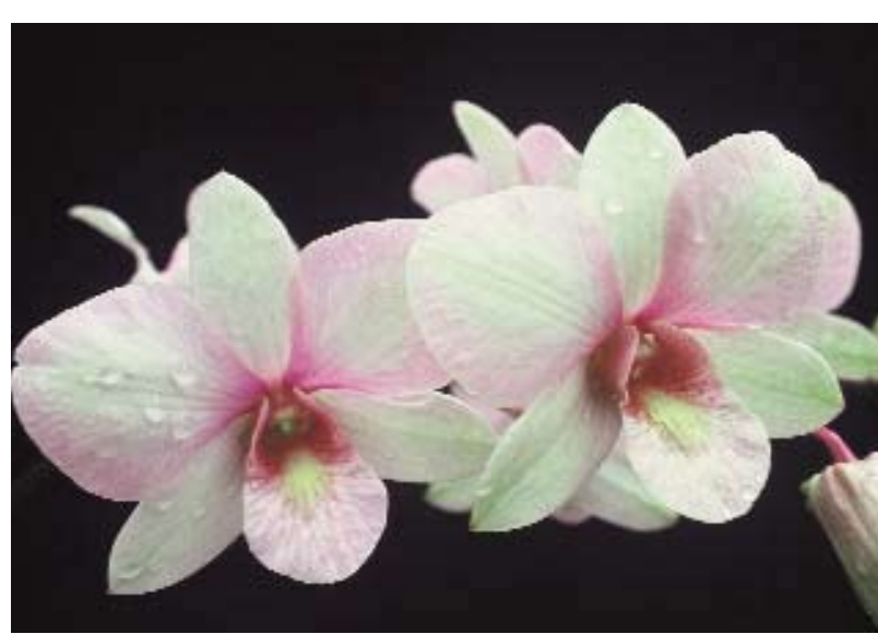
Dendrobium World Peace

The venues for the events of the 20th WOC in Singapore will be in brand new multi-million dollar projects that are currently under development. The conference and show will be in the Marina Bay Sands, a bold new development by the proprietors of Las Vegas Sands, which will house Singapore's first ever casino, as well as an opulent hotel, convention facilities, food and beverage establishments, upscale shops and entertainment complexes. Next door is the billion dollar Gardens by the Bay, currently being developed by Singapore as the latest addition to the growing inventory of parks and gardens of Singapore. Gardens by